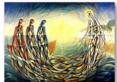
Depiction of Luke 5:1-11